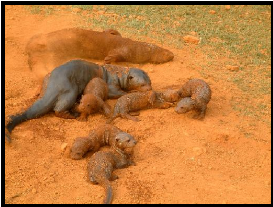
Giant Otter Family at Brasilia Zoo. Photo by Volker Gatz, 2002.